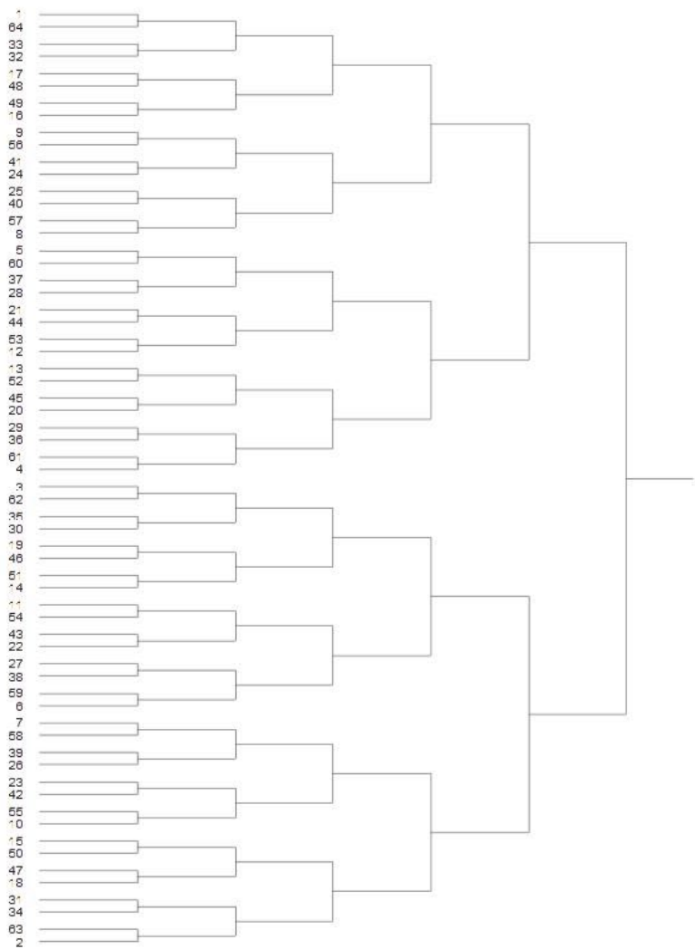
Figure 7a. Bout plan for individual direct elimination (table for 64 fencers)